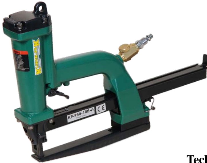
KP-P50-779 Pneumatic Plier Stapler